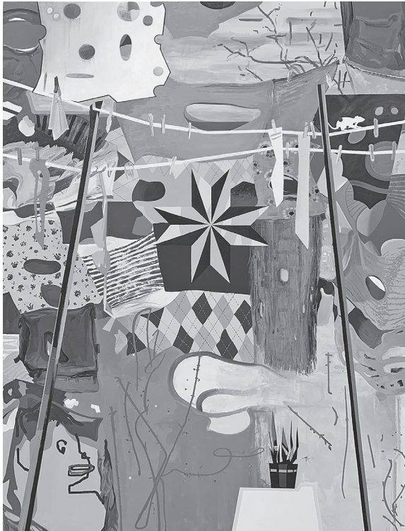
The Wall, oil on canvas