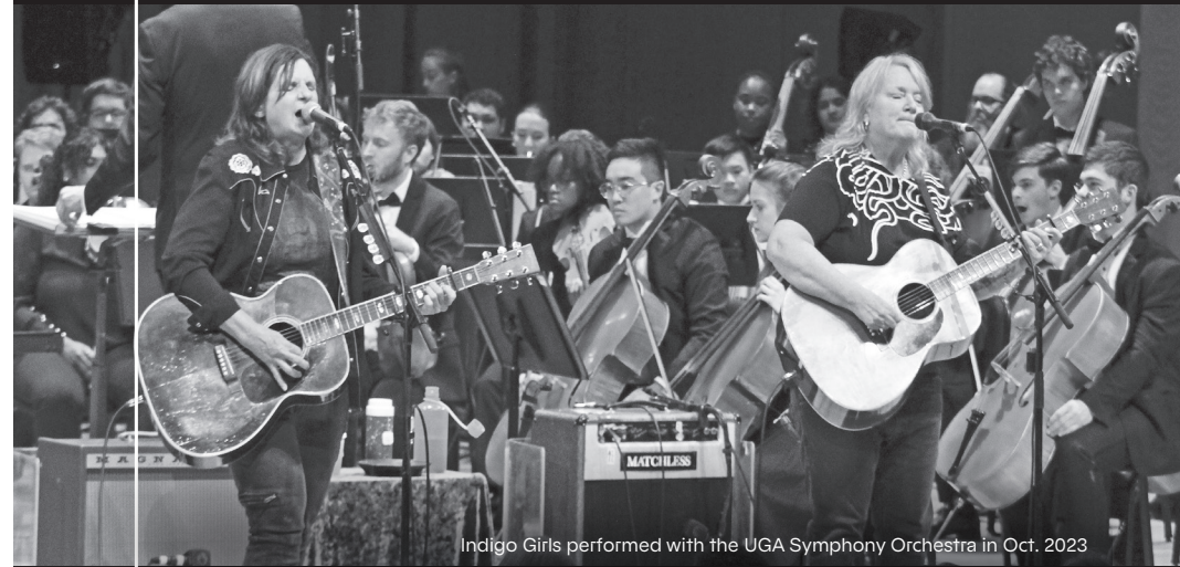
Indigo Girls performed with the UGA Symphony Orchestra in Oct. 2023

Will you join us in honoring our past and investing in what's next?