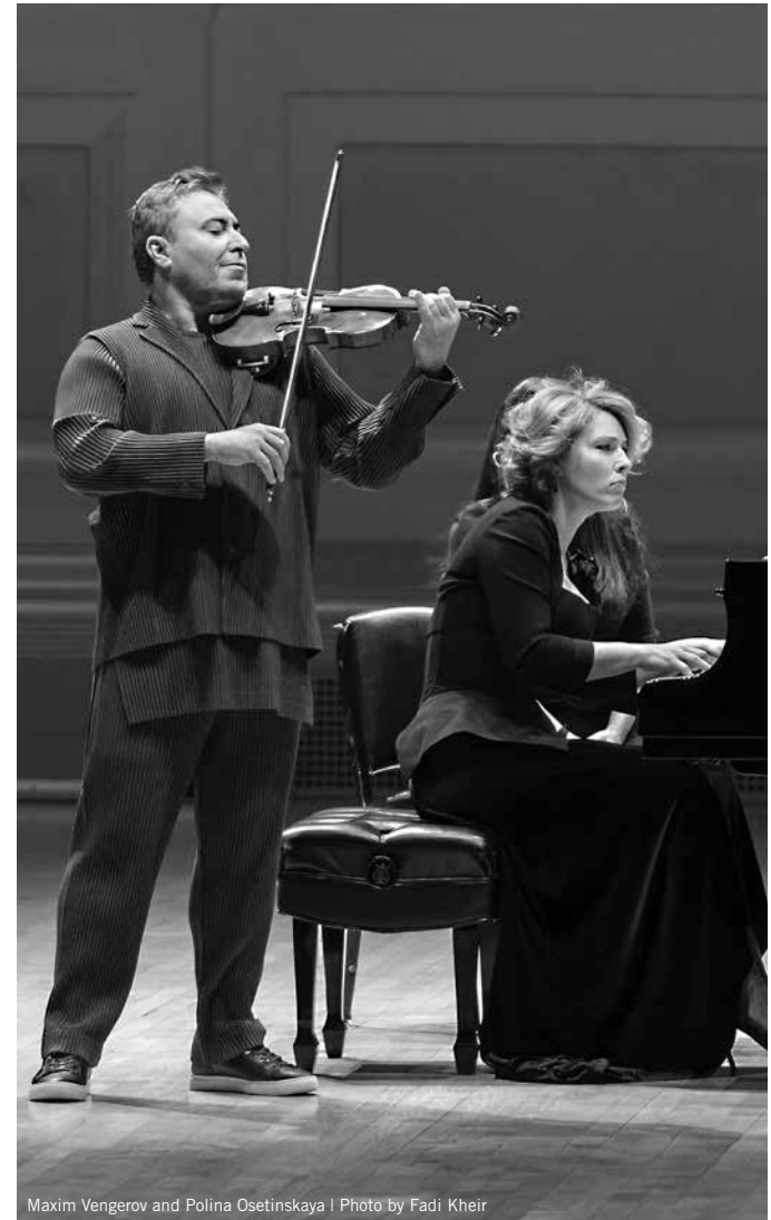
Maxim Vengerov and Polina Osetinskaya

Ticket prices include 8% Georgia state sales tax and $2 facility restoration fee per ticket.