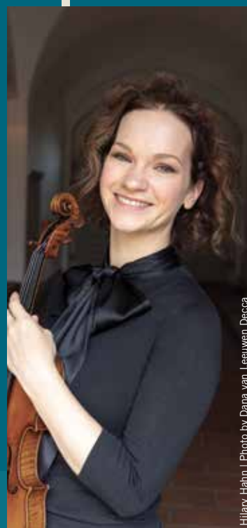
Hilary Hahn

Special Events are excluded from all package discounts.