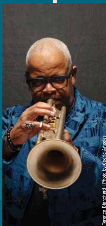
Terence Blanchard