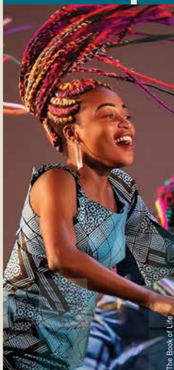
The Book of Life

Create your own customized series of any three or more performances and save 10%.