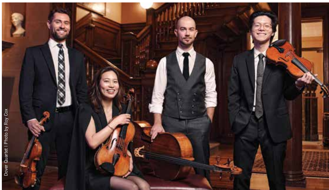
Dover Quartet

The Poulenc Trio is the most active touring piano-wind chamber music ensemble in the world. Since its founding in 2003, they have performed in 45 U.S. states and at music festivals across the globe. The ensemble has rediscovered and redefined piano-wind chamber music for the 21st century in a dynamic and thrilling way.