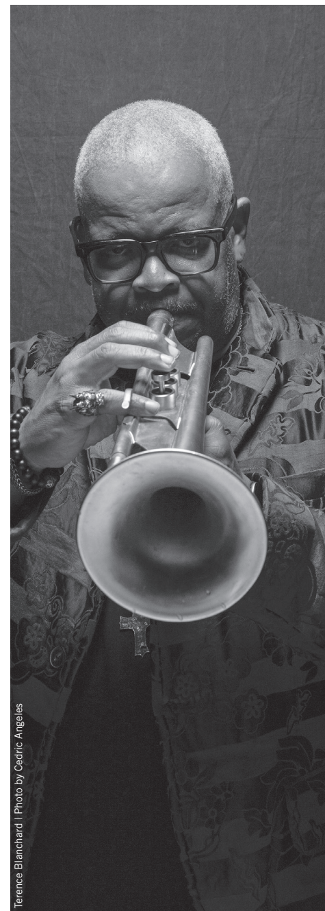
Terence Blanchard

Ticket prices include 8% Georgia state sales tax and $2 facility restoration fee.